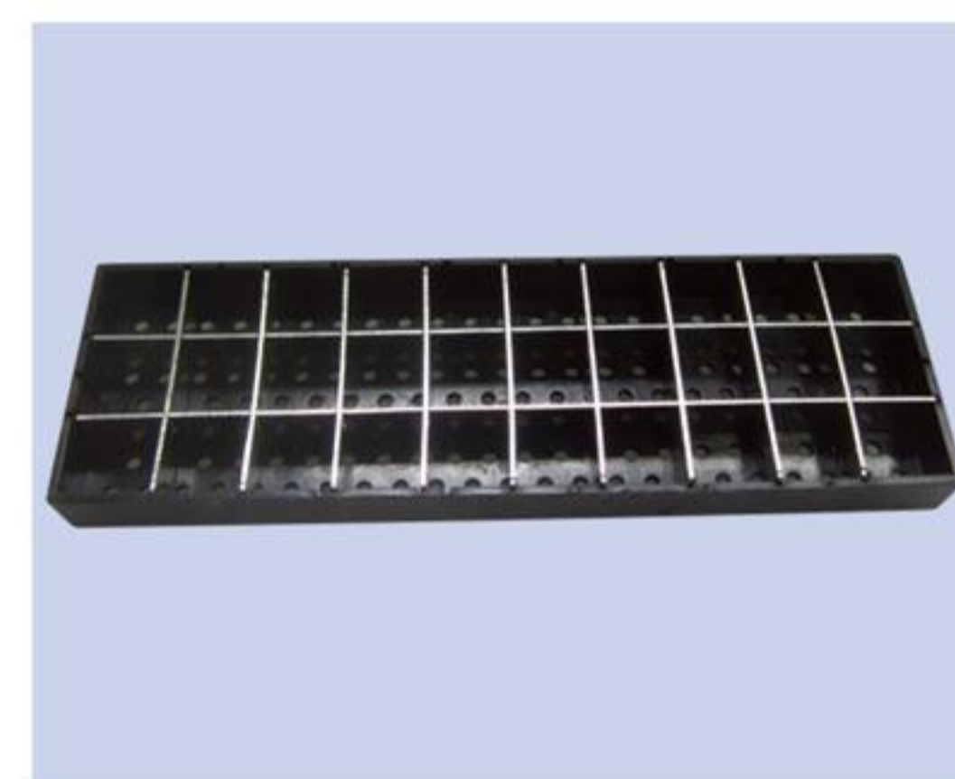
3X10 grid panel for small tissues