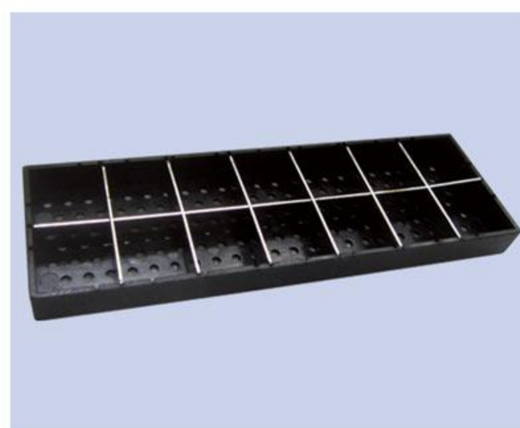
2X7 grid panel for large tissues